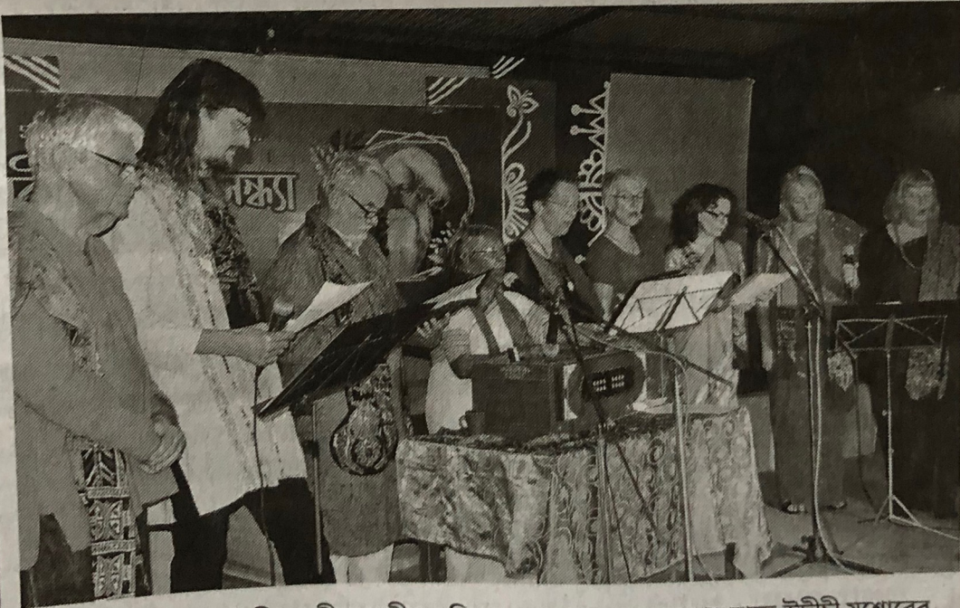
সুইডেন থেকে আসা শিল্পীরা রবীন্দ্রসংগীত পরিবেশন করছেন। গত বুধবার রাতে উদীচী যশোরের রুহুল হক মঞ্চে।