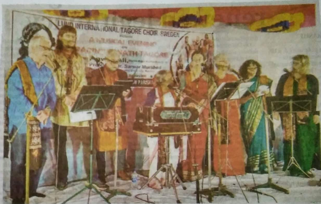
Members of Lund International Tagore Choir performing at a musical programme at Tagore Lodge in Kushtia on Friday.